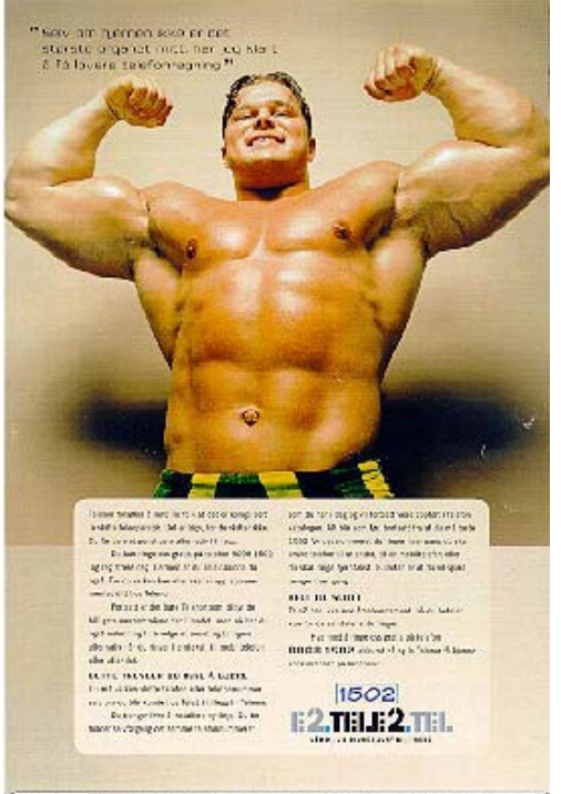
Nå kan du ringe for halv pris liver helg i helejuli.

A printed advertisement may express a derogatory appraisal while also exploiting one gender's body. It may be a question of individual judgement whether the advertisement does either of these things, or both.